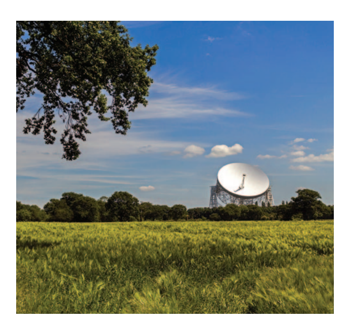
Priority 12 - Horizon scanning

The experiences of delivering communications throughout the COVID-19 pandemic have provided valuable opportunities for learning.