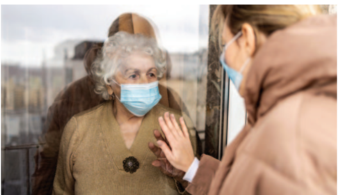
Aim 4 – Build resilience to respond to new circumstances and emergencies

Therefore, we must take steps to ensure that the council has a clear identity and a clear and consistent voice.